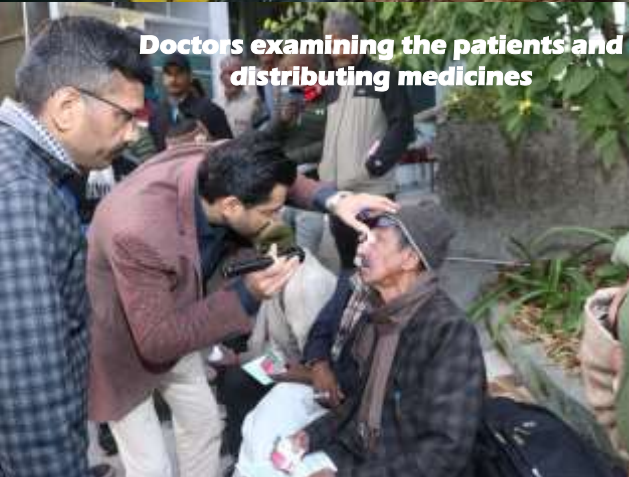
Doctors examining the patients and distributing medicines