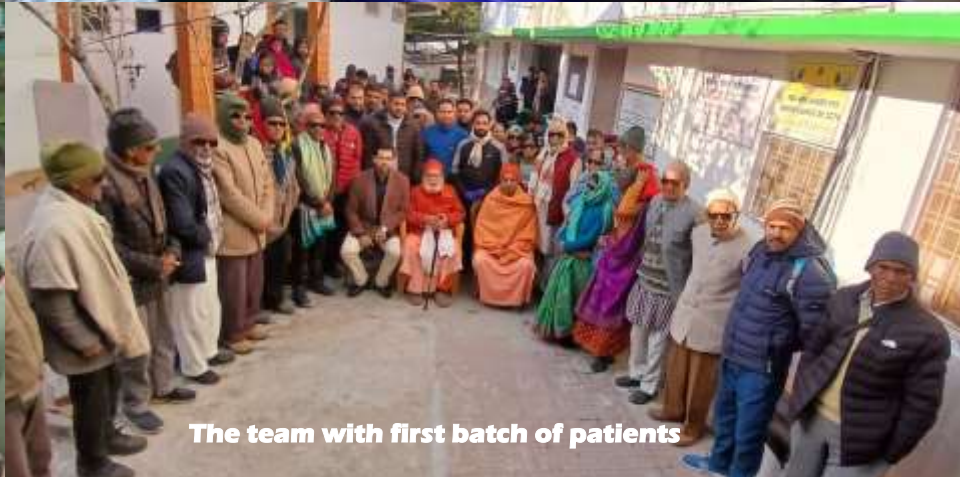
The team with first batch of patients