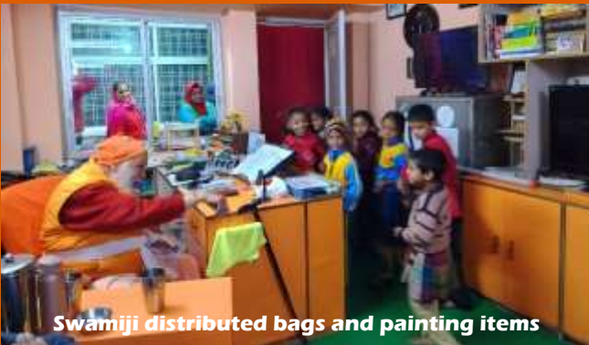
Swamiji distributed bags and painting items