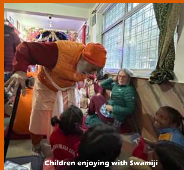
Children enjoying with Swamiji