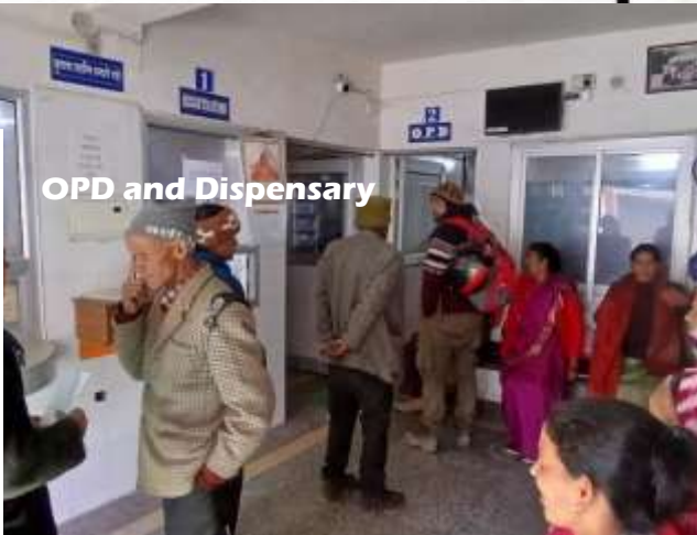
OPD and Dispensary