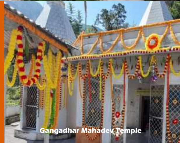
Gangadhar Mahadev Temple

Total No. of such People/ Families supported: 97