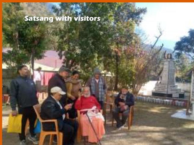
Satsang with visitors