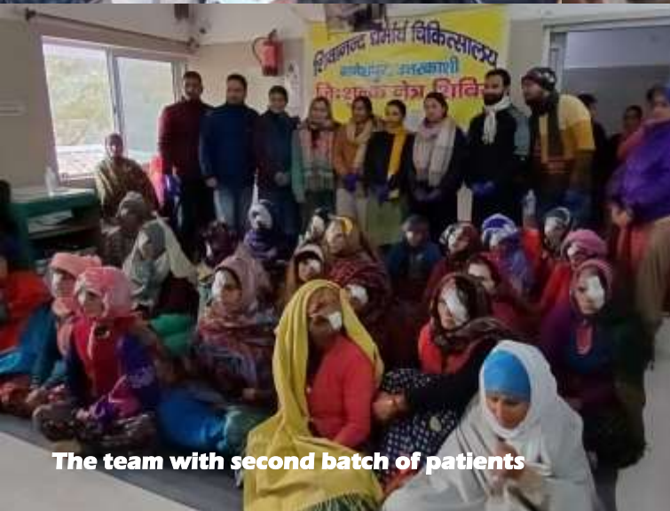
The team with second batch of patients