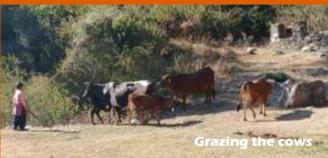
Grazing the cows

Total No. of Students supported in the month of December: 11