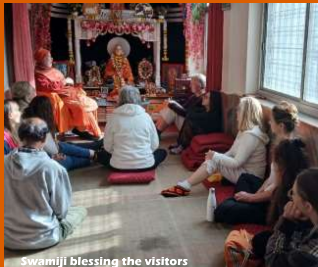
Swamiji blessing the visitors