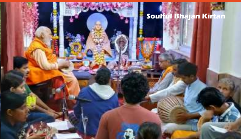
Soulful Bhajan Kirtan