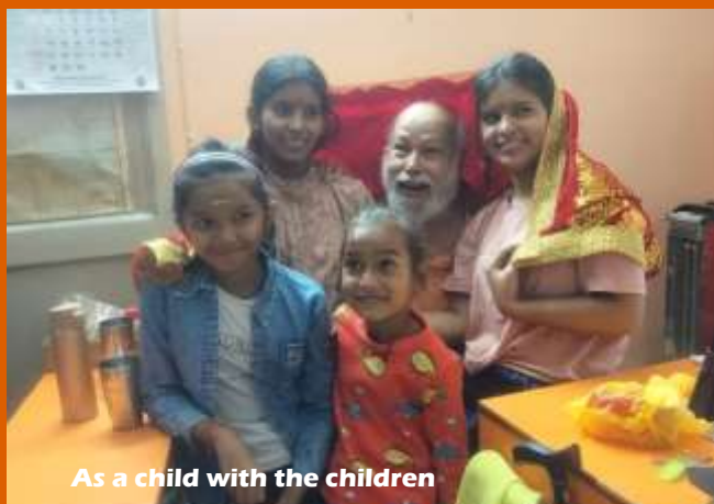
As a child with the children