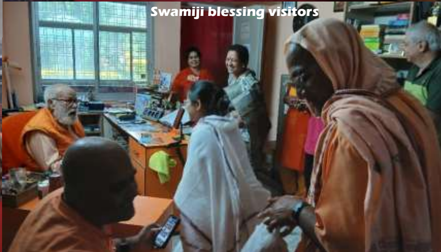
Swamiji blessing visitors