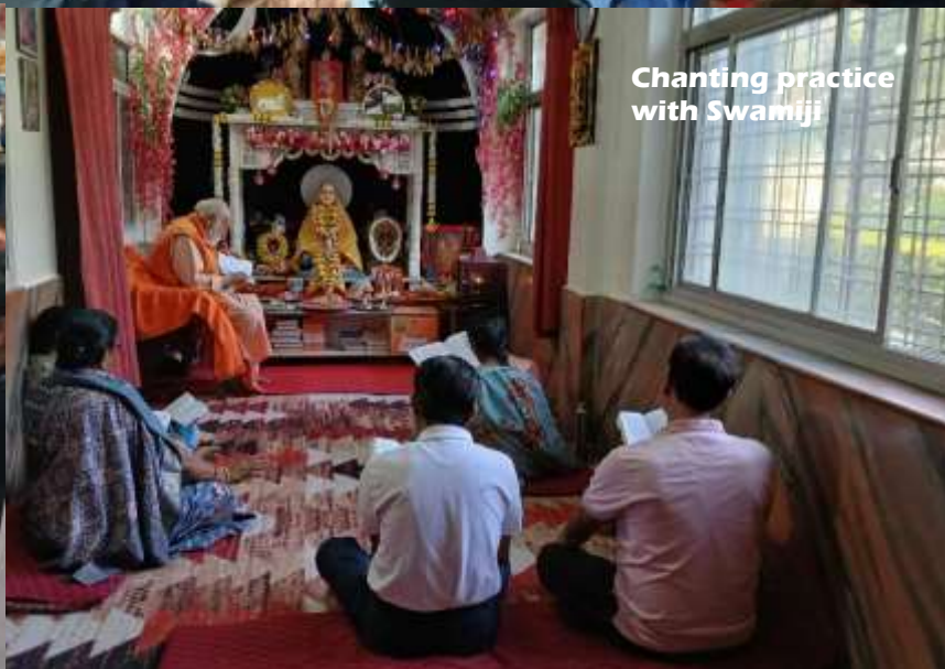
Chanting practice with Swamiji