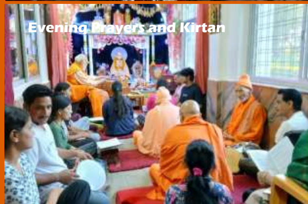
Evening Prayers and Kirtan