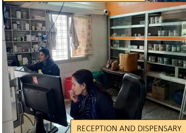
RECEPTION AND DISPENSARY

Health is state of complete harmony of body, mind and spirit. When one is free from physical disabilities and mental distractions, The gates of the soul open.