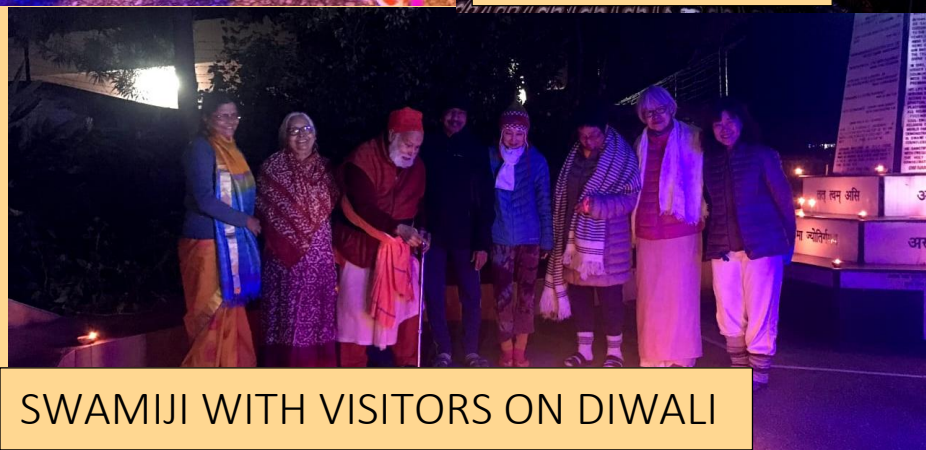
SWAMIJI WITH VISITORS ON DIWALI