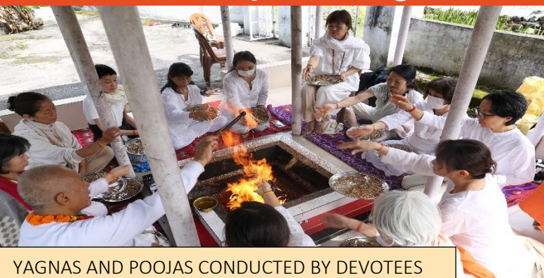
YAGNAS AND POOJAS CONDUCTED BY DEVOTEES