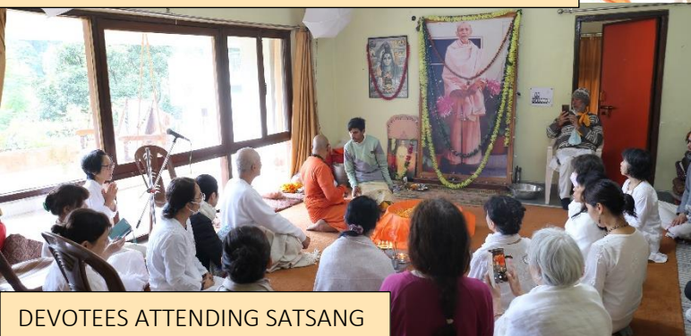
DEVOTEES ATTENDING SATSANG