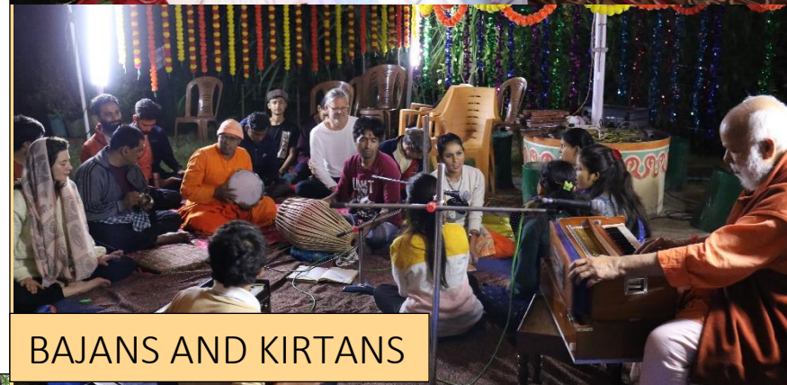
BAJANS AND KIRTANS