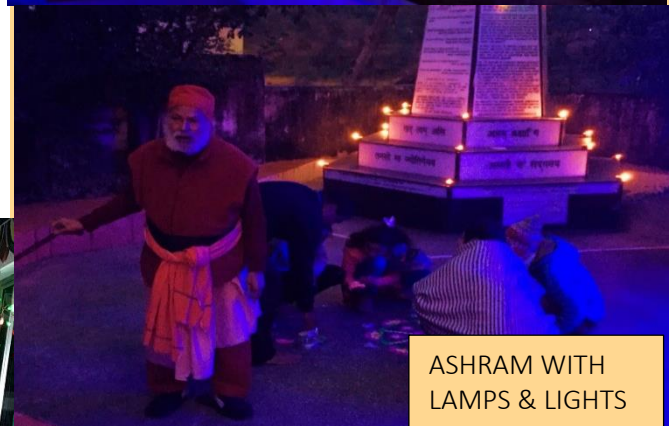
ASHRAM WITH LAMPS & LIGHTS