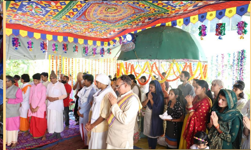
DEVOTEES ATENDING POOJA