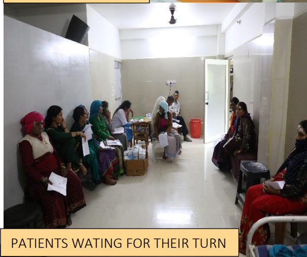
PATIENTS WAITING FOR THEIR TURN